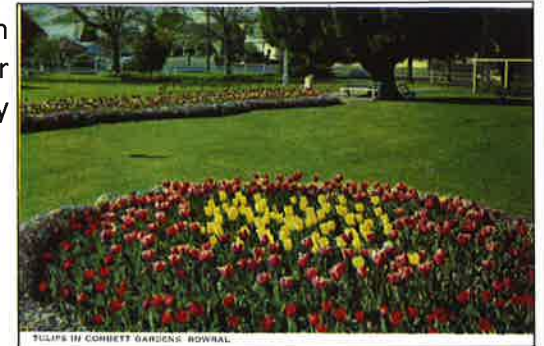
Corbett Gardens 1950's

This 50th Anniversary year of 2010 sees an increased events program, with many special activities taking place in Bowral. This year’s activities are being coordinated by Southern Highlands Tourism with many special events arranged, including a street parade, a fine food & wine street fair, breakfast in the park, tulips after dark, lantern street parade and open air cinema and fireworks display at Bradman Oval.