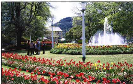
Second Water Feature—1984