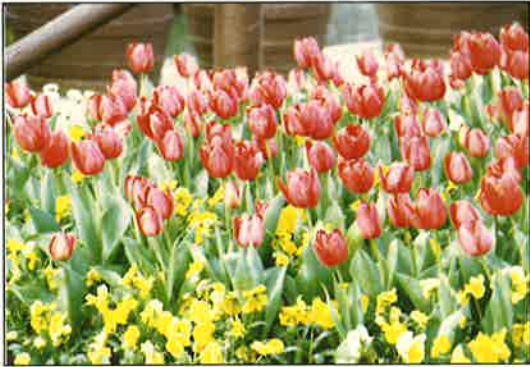
“See the Tulips tread the gardens, Row on row, with heads held high”

Little did anyone realise that this festival would grow into such a well known event and eventually become a premier Floral festival in NSW.