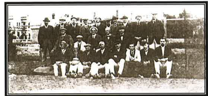
Bowling Club at Corbett Gardens prior to the Gardens being transformed into a beautiful place for visitors.