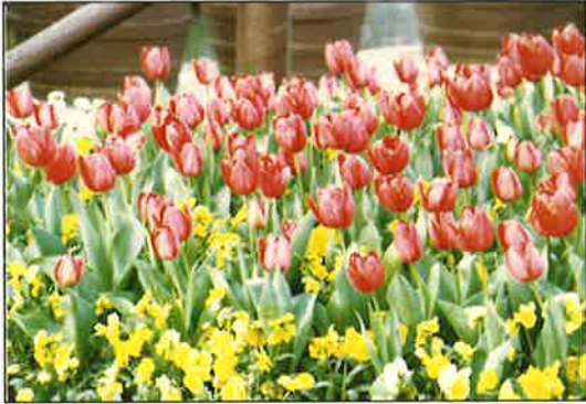
“See the Tulips tread the gardens, Row on row, with heads held high”

Little did anyone realise that this festival would grow into such a well known event and eventually become a premier Floral festival in NSW.