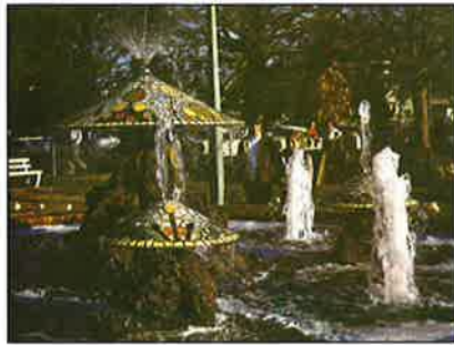
First Water Feature—1967