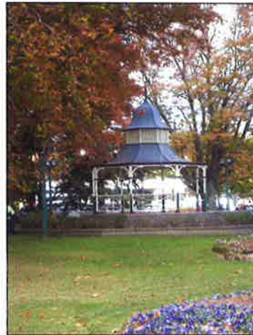
2010 - Rotunda, built 1996

Production of this booklet kindly sponsored by the Springett Family Printing supported by Hypercett Printing, Mittagong