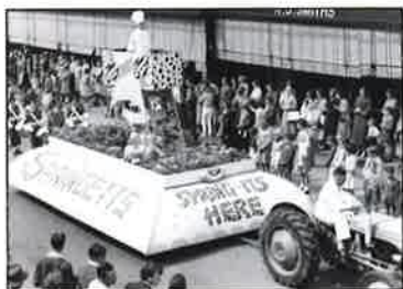
Festival of Flowers float 1958

The concept of a festival was taken up by local groups to publicize the town of Bowral. A committee was formed and a week long Floral Festival was staged in October of 1958. A Queen competition and street