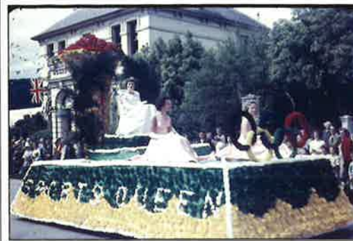
Festival of Flowers float—1959

encourage others to do likewise. Tall yellow tulips were grown in beds with bright red anemones and pink and white Bellis perennis. The tulips thrived and the result was spectacular. Tourists came in large numbers (many had never seen tulips before) and