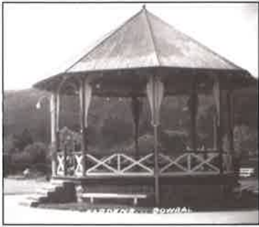
Original Bandstand—opened 1914